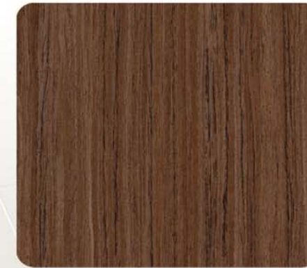
Qtr. Teak TK-016S