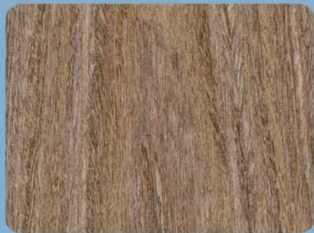
Santa Monica WSW-529C