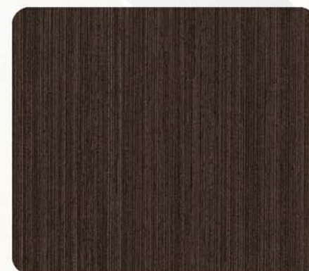
Qtr. African Wenge TD-5843S