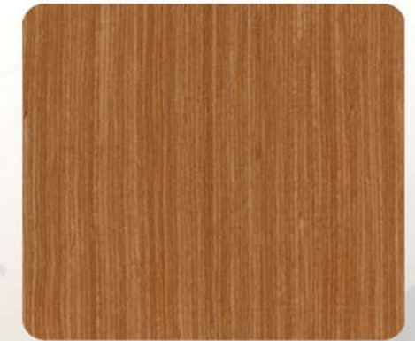
VG Fir Fir-3Q