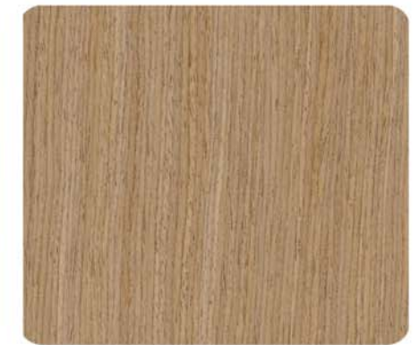
Rift White Oak Oak-12-1S