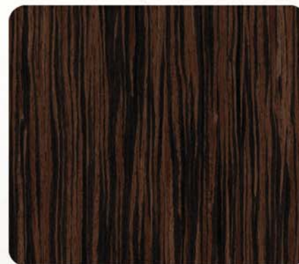
Qtr. Macassar Ebony EB-7001S