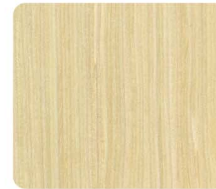
Qtr. Maple MP-168S