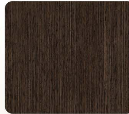
Qtr. Wenge WG-111Q