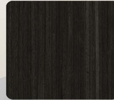
Qtr. Gun Metal Ebony WT-2450S