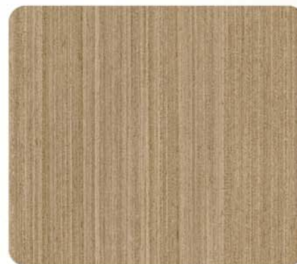
Qtr. Champagne Champ-2Q