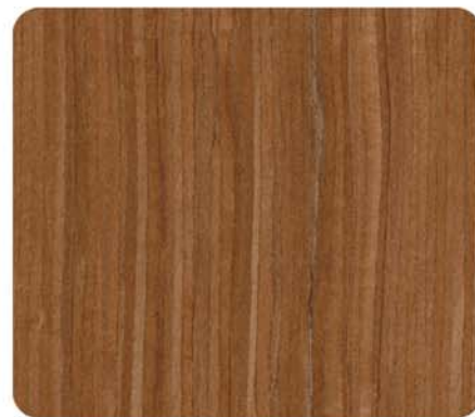
Qtr. Cherry CH-311S