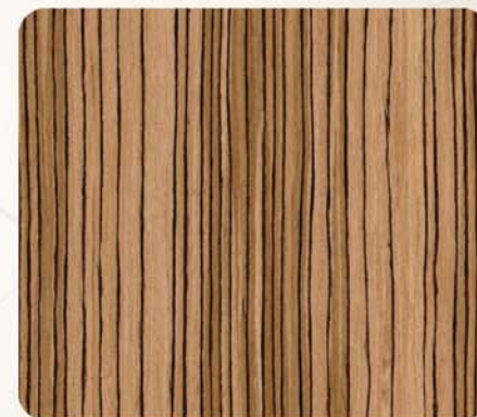
Qtr. Zebrano ZB-011S