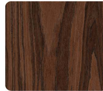
PS Rosewood RW-3350C