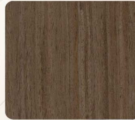
Qtr. Walnut WT-139S