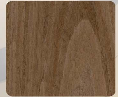
PS Walnut WT-3160C