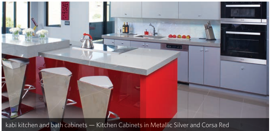
kabi kitchen and bath cabinets — Kitchen Cabinets in Metallic Silver and Corsa Red

The flawless surface is as beautiful as it is functional, making it perfect for modern interior design such as; cabinetry, vanities, wall paneling, furniture, store fixtures and displays.