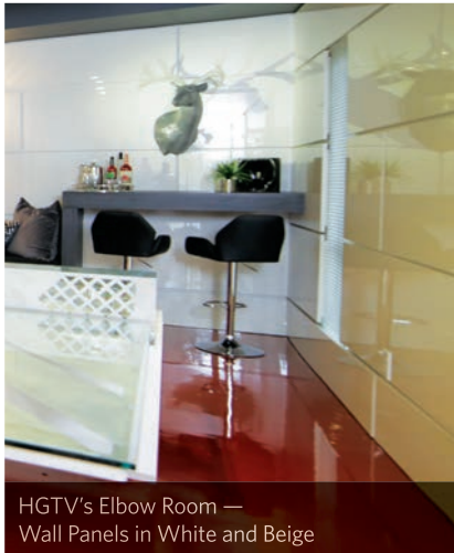
HGTV's Elbow Room — Wall Panels in White and Beige