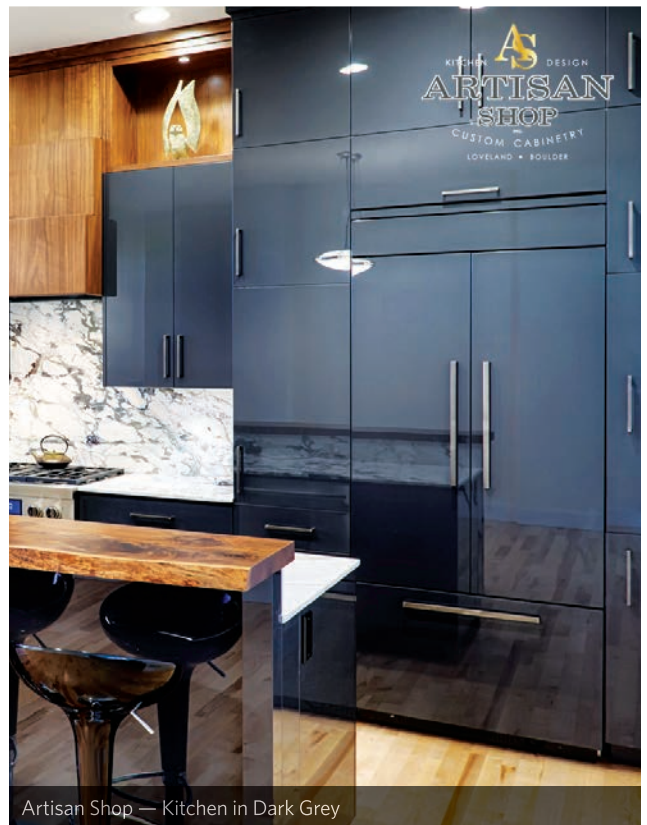
Artisan Shop — Kitchen in Dark Grey