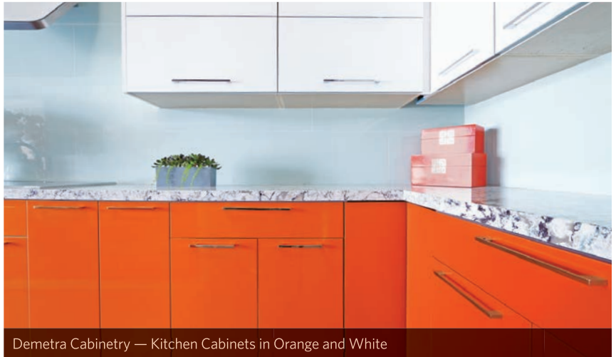
Demetra Cabinetry — Kitchen Cabinets in Orange and White