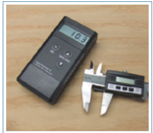
Integrity of the core is critical. Our extensive inspection process ensures predictable results.